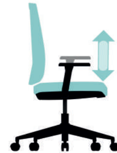
Height adjustable arm