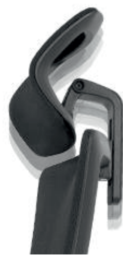
Neck-rest height adjustment

It can be adjusted according to the height and neck position of the user, which is comfortable and convenient