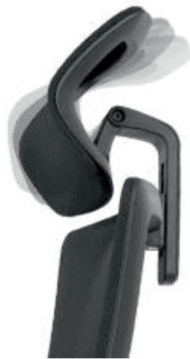
Neck-rest angle adjustment