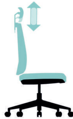
Height adjustable head