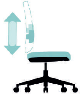
Height adjustable lumbar