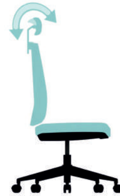
Angle adjustable head