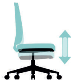
Seat height adjustment